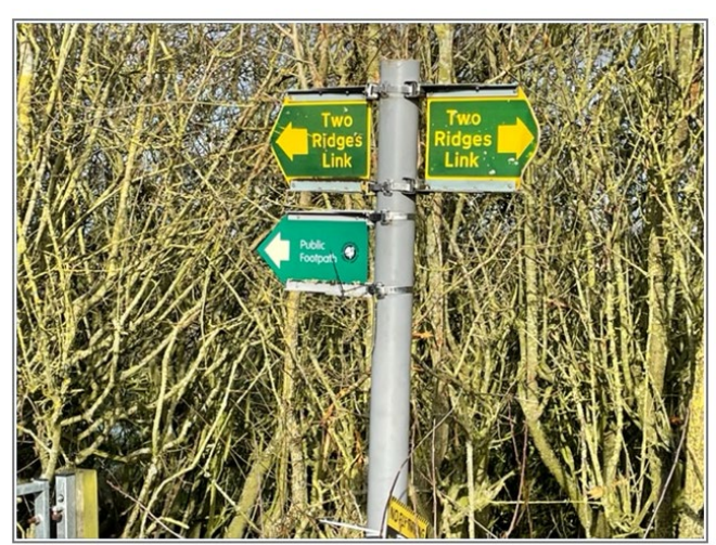
Signpost to Two Ridges Public Footpath

The temporary access route proposed (noted as 'Route 6' in Project Update 3) is signposted as 'Two Ridges Link' and a 'Public Footpath'. See photograph below.